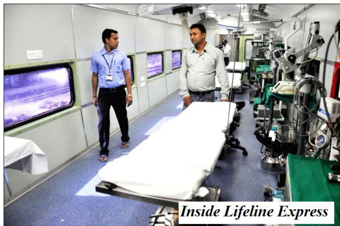
Inside Lifeline Express